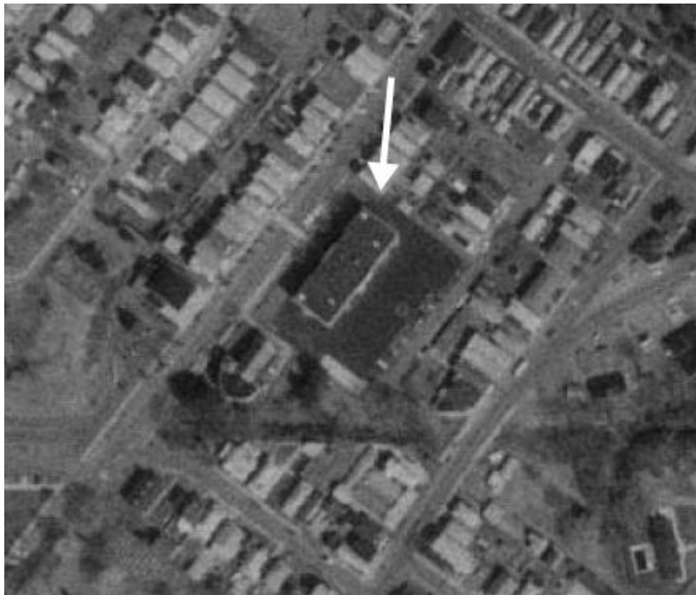
Aerial View of Lee Park Elementary School

1992 Wilkes-Barre West NE, PA Aerial Photograph . USGS Reference Number 41075-B8-02-PHT. Created on April 6, 1992.